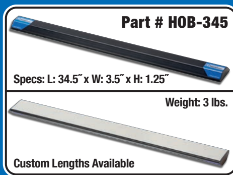
Part # HOB-345