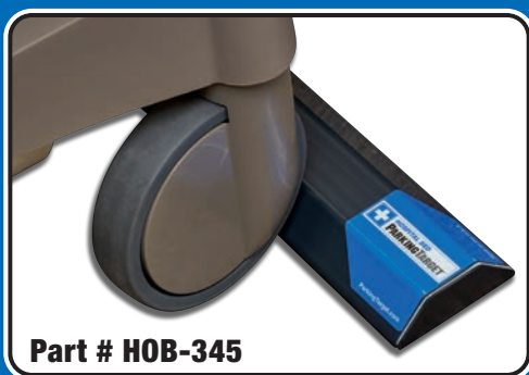
Part # HOB-345